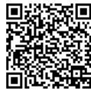
One Step to the Web!

Cut lengths available on request. Please contact us!