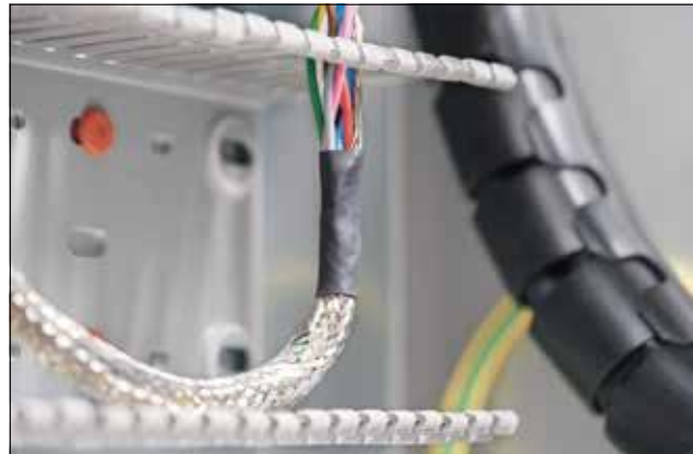
TF21 – available in a wide range of colours and sizes.